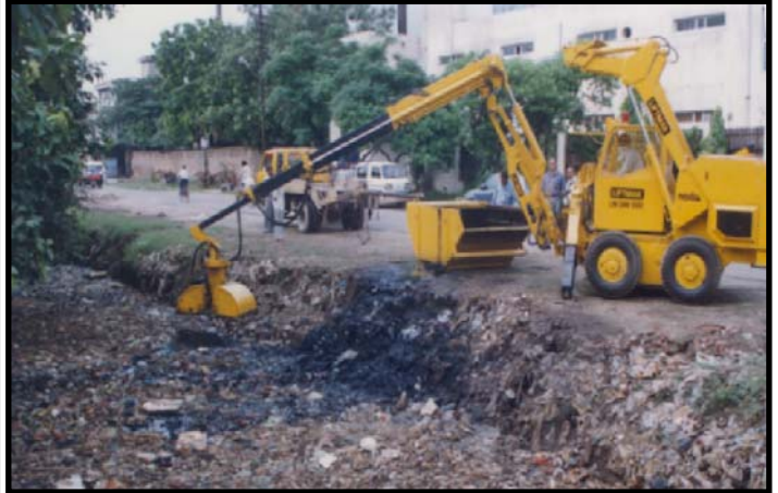
SKID STEER DRAIN CLEANING ATTACHMENT

There are several attachments possible with the skid steer loader, such as backhoe, auger, sweeper, 4-1 bucket etc. Photograph of backhoe is as under: