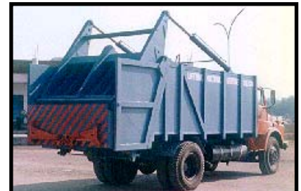
MULTIPAK REFUSE COMPACTOR