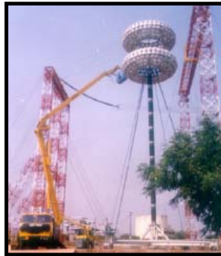
3-BOOM ARTICULATED ON MULTI-AXLE CHASSIS