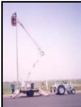
2-BOOM ON TRAILER