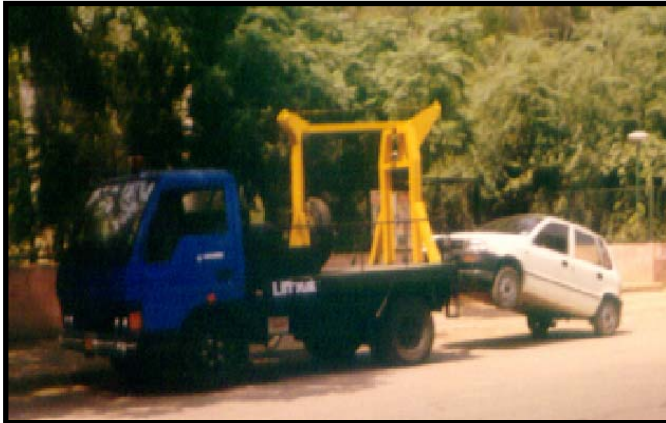
Light Recovery Vehicle

OTHER ALLIED EQUIPMENT: To meet the specific needs of our valued customers, we are constantly innovating and designing new products. A few examples are Recovery vehicles, Hydraulic tail gate system, wing bodies, expandable bodies etc. –