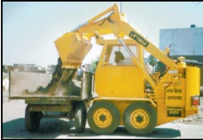
LIFTMAK SKID STEER LOADER LOADING TRAILER

SKID STEER LOADER/BACKHOE/DRAIN CLEANING ATTACHMENT: We have pioneered the development of the skid steer loader in India, which was so far being imported. Action photographs are as under: