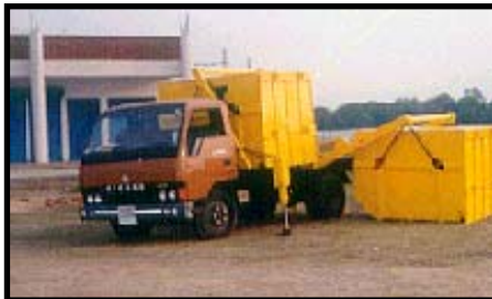
TWIN CONTAINER DUMPER PLACER