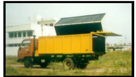
Garbage Tipper with Hydraulic Top Cover

Apart from the above, our range of municipal equipment includes