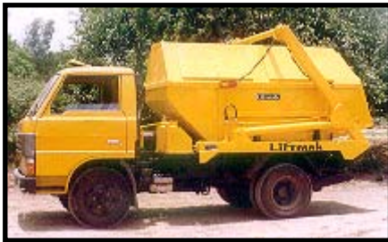
DUMPER PLACER/SKIP LIFTER

MUNICIPAL EQUIPMENT: Liftmak manufactures a wide range of municipal equipment including dumper placers (skip lifters) of diverse designs and capacities, roll-on/off tippers, refuse compactors, jetting and suction machines. A few examples are illustrated in the following photographs –