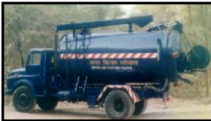
Sewer Line Jetting Machine