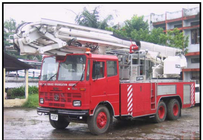
LIFTMAK FIRE FIGHTING AND RESCUE PLATFORM MOUNTED ON TATA 2515 3-AXLE CHASSIS