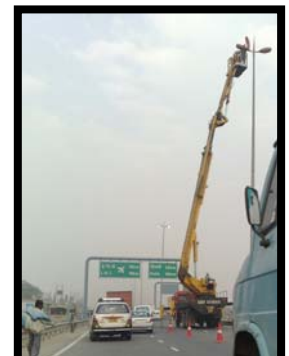
Telescopic cum articulated zero elbow design with basket resting on vehicle deck in stowed position for quick start up